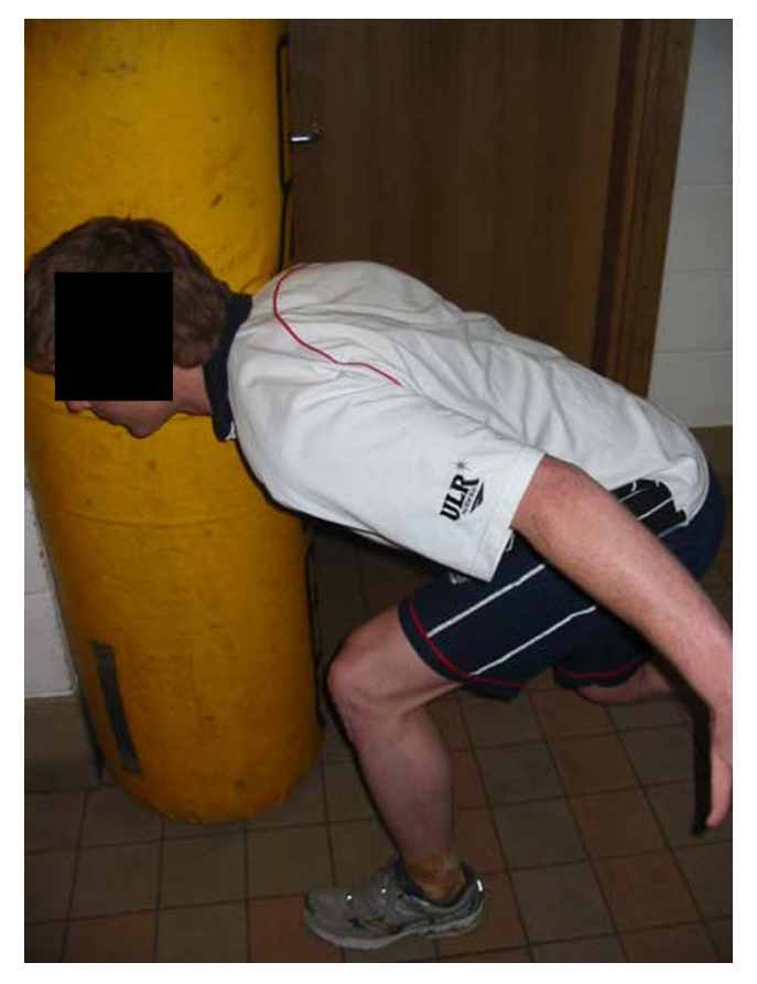
Figure 2 Foot and body position at contact.

Data were analysed using the statistical software package SPSS (version 12). Differences in time of onset between muscles were analysed with a factorial ANOVA with two factors (side (left or right) and muscle). The critical alpha level chosen \alpha = 0.05 for all analysis. Paired t-tests were used to evaluate specific differences found (corrected for family-wise inflation of type 1 error with Bonferroni corrections). In order to assess the test- retest reliability of the muscle onset timing, the second and the fifth repetition for each subject for all muscles was compared using intraclass correlation coefficient (ICC) to assess both the