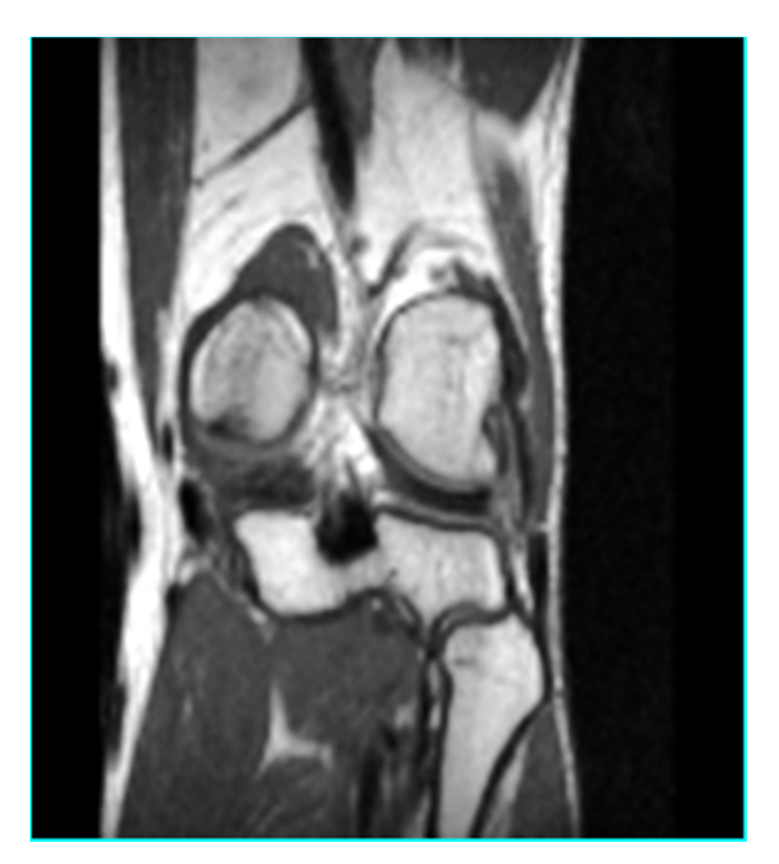
Figure I Coronal TI weighted image showing a mild inflammation within the popliteus tendon course, but not clear signs of tear.