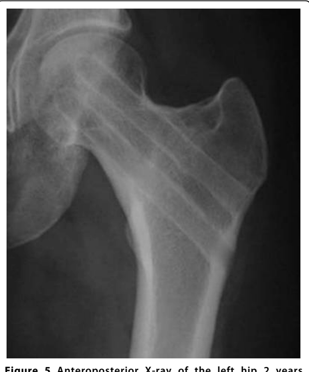
Figure 5 Anteroposterior X-ray of the left hip 2 years postoperatively. Bone union is evident.

Exercise-induced amenorrhea was thought to be a normal part of high-intensity training in 1980, and that once stressful training was discontinued, the menstrual cycle would return to normal [8]. However, some female athletes with amenorrhea also have an eating disorder and osteopenia. The American College of Sports